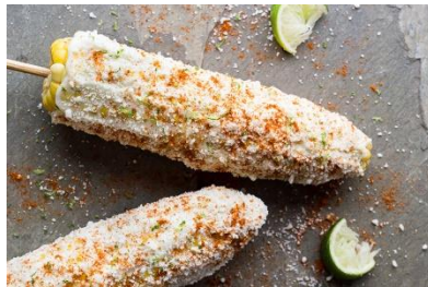
Mexican Food: Elote

2. The most popular sport in Mexico is soccer.