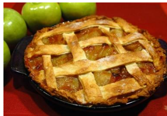
United States Food: Apple Pie

2. The first man to walk on the moon was from the United States.