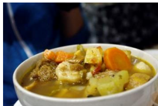
Belize Food: Cow Foot Soup