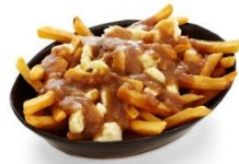
Canadian Food: Poutine

Cool Facts: 1. Basketball was created in Canada. 2. Maple syrup comes from Canada.