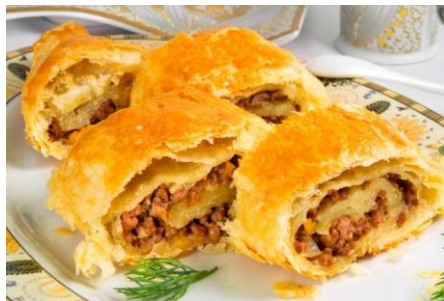
Pastelitos De Carne