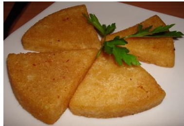
Jamaica Food: Bammy