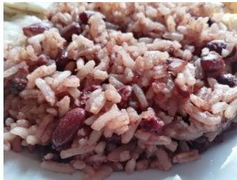
Nicaragua Food: Gallo Pinto