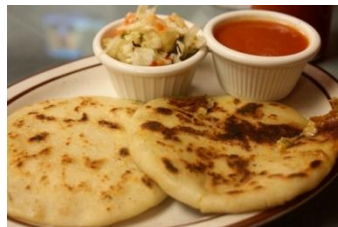
El Salvadorian Food: Pupusa

2. The most popular sports in El Salvador are soccer and surfing.