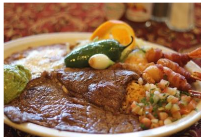
Honduras Foods: Carne Asada

2. Once a year, in the summer, it rains fish!