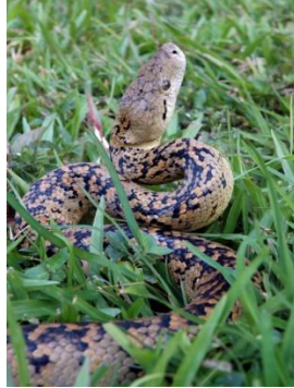
Animals: Jamaican boa snake