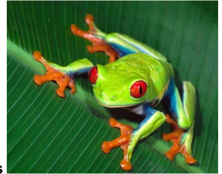
Red eyed tree frogs

Cool Facts: 1. Honduras celebrates children's day!