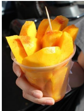
Guatemala Food: Spiced Mango

2. The first chocolate bar came from Guatemala.