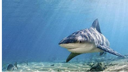
Animals: Bull Shark