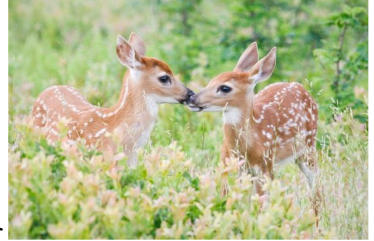
White Tailed Deer