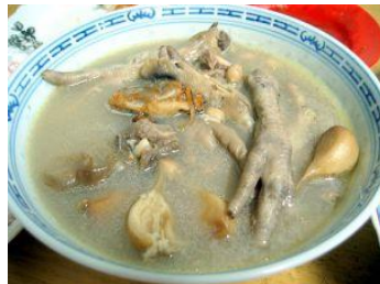
Chicken foot soup